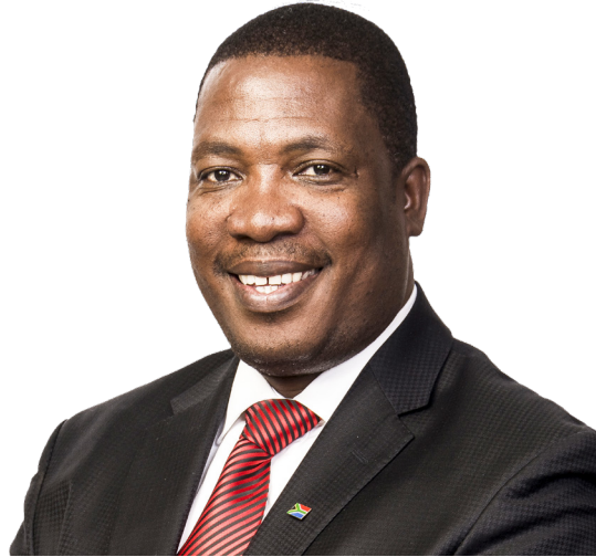
Gauteng Premier, Panyaza Lesufi

In that regard, job opportunities will be created by advertising all available funded vacancies within Gauteng Provincial Government (GPG) departments and their entities.